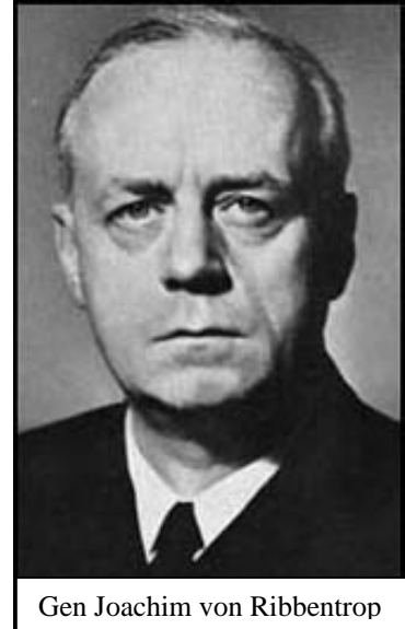
Gen Joachim von Ribbentrop