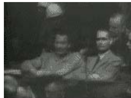
Hermann Goering and Rudolph Hess

While assigned to Erlenstegen, they were holding the war crimes there at Nuremberg. The major trials included Hermann Goering and Rudolph Hess. One of the trials was a General Joachim von Ribbentrop.