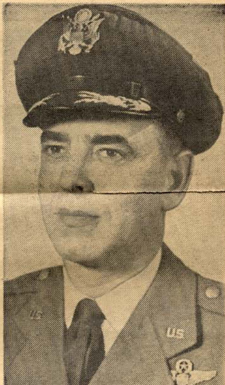
Col Robert R. Rowland, a World War II ace and commander of the 21st Wing, hopes to have tactical aircraft back soon.

I N THE AIR FORCE, an outfit deprived of its planes is like a bird without wings. It's a little lost and lonely and even a bit confused.